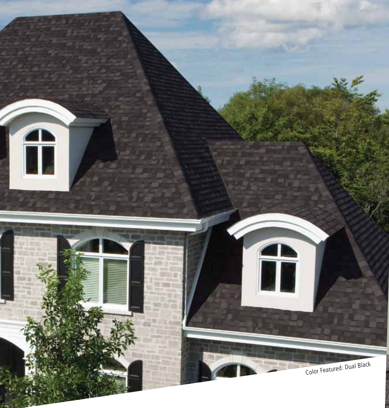
Color Featured: Dual Black